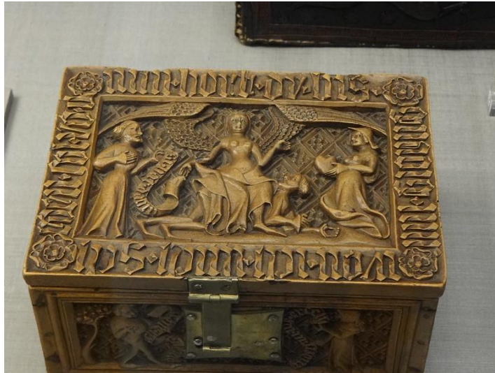
A besotted Aristotle gives his pupil Phyllis a ride on this ivory box in the wonderful Kunstgewerbemuseum

Connected to the Gemäldegalerie by a short tunnel, the Museum of Decorative Arts—the Kunstgewerbemuseum—displays works ranging right up to the present day. Among the many precious objects exhibited here is a large collection of reliquaries, altars, and other liturgical objects, many of them from the so-called Guelph Treasure.