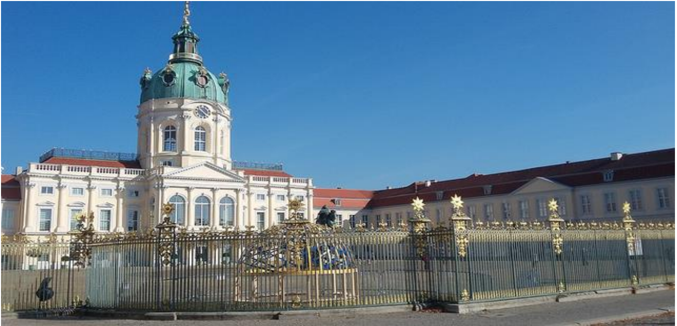
Schloss Charlottenburg

NIGHT: Novotel Hotel Berlin am Tiergarten, Berlin