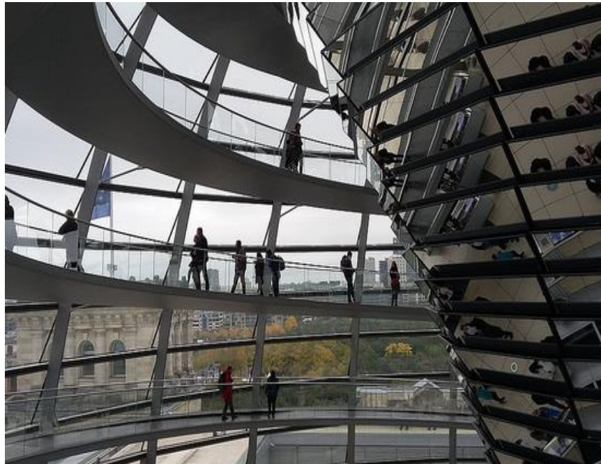
Reichstag Dome

September 29, Day 2: Arrival in Berlin, and the Reichstag. We will meet at 5:00 p.m. in the lobby of our centrally located hotel for introductions, then catch a train to the Brandenburg Gate. We will have dinner together and, if circumstances permit, ascend to the top of the Reichstag Building, seat of the German government. This neo-Baroque structure was burned in 1933, with fateful political consequences, and finally reconstructed in the 1990s, with the addition of a spectacular glass dome. If the dome is open – which depends on Parliament sessions, weather, and staffing – we will enjoy a beautiful evening panorama of Berlin and the surrounding countryside before retracing our steps to our hotel.