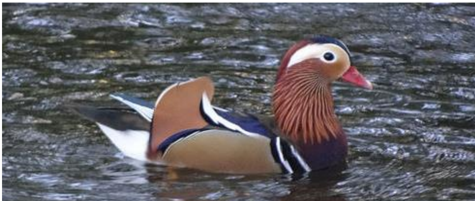
Mandarin Duck

We will have lunch in the neighborhood, then have the option to visit one or the other of Charlottenburg's fine smaller museums. The Bröhan Museum features decorative works of art nouveau and art deco from France, Germany, and Austria, while the Berggruen is justly famous for its modern art, including particularly notable works by Matisse, Klee, and Giacometti. The holdings of the Scharf-Gerstenberg collection of fantastic and surrealist art reach from Piranesi to Picasso. We will return to our hotel before dinner.