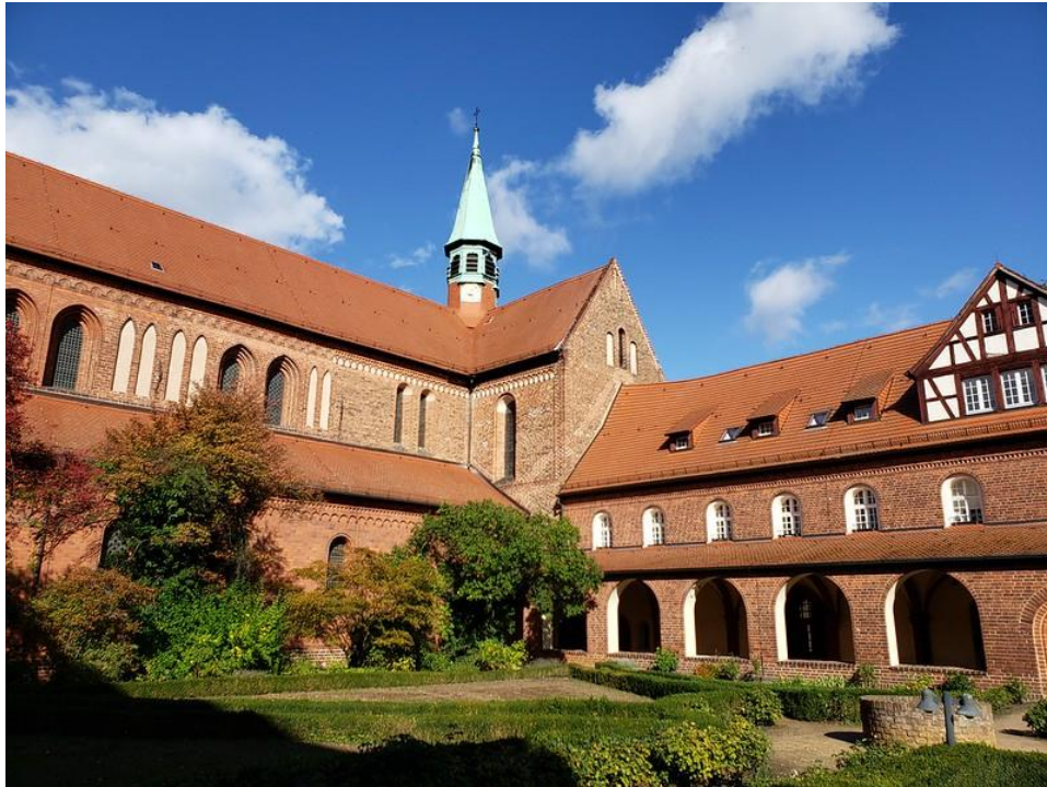
The former Cistercian monastery of Lehnin

NIGHT: Novotel Hotel Berlin am Tiergarten, Berlin