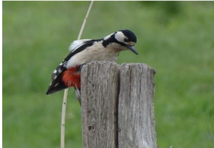
Great Spotted Woodpecker

September 30, Day 3: Birds and Berlin. Across the street from our hotel, the 520-acre Tiergarten was established as a royal hunting preserve nearly 500 years ago. Today, the formal beds, brushy edges, and tall trees boast a surprising variety of breeding and wintering birds. We will go out this morning in search of such residents as Mandarin and Tufted ducks, Great Spotted Woodpecker, Blue and Great tits, Short-toed Treecreeper, European Nuthatch, and Hooded Crow. Early risers can start before breakfast, where we will meet up with the rest of our group to continue the walk.