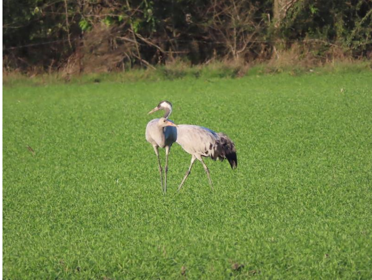
A young Common Crane follows a parent on its first southward migration

We will have a light lunch together across the river from the museums then depart for the hour-long drive into the soggy landscapes just northwest of Berlin. The fields, ponds, and marshes around the village of Linum are the most significant inland staging area in Europe for southwest-bound Common Cranes, and in the late afternoon, we can hope to see hundreds, even thousands, on the surrounding pastures and overhead. If the evening flight is good, we will linger at the viewing areas until sunset, then return to Berlin for a final dinner together in our hotel.