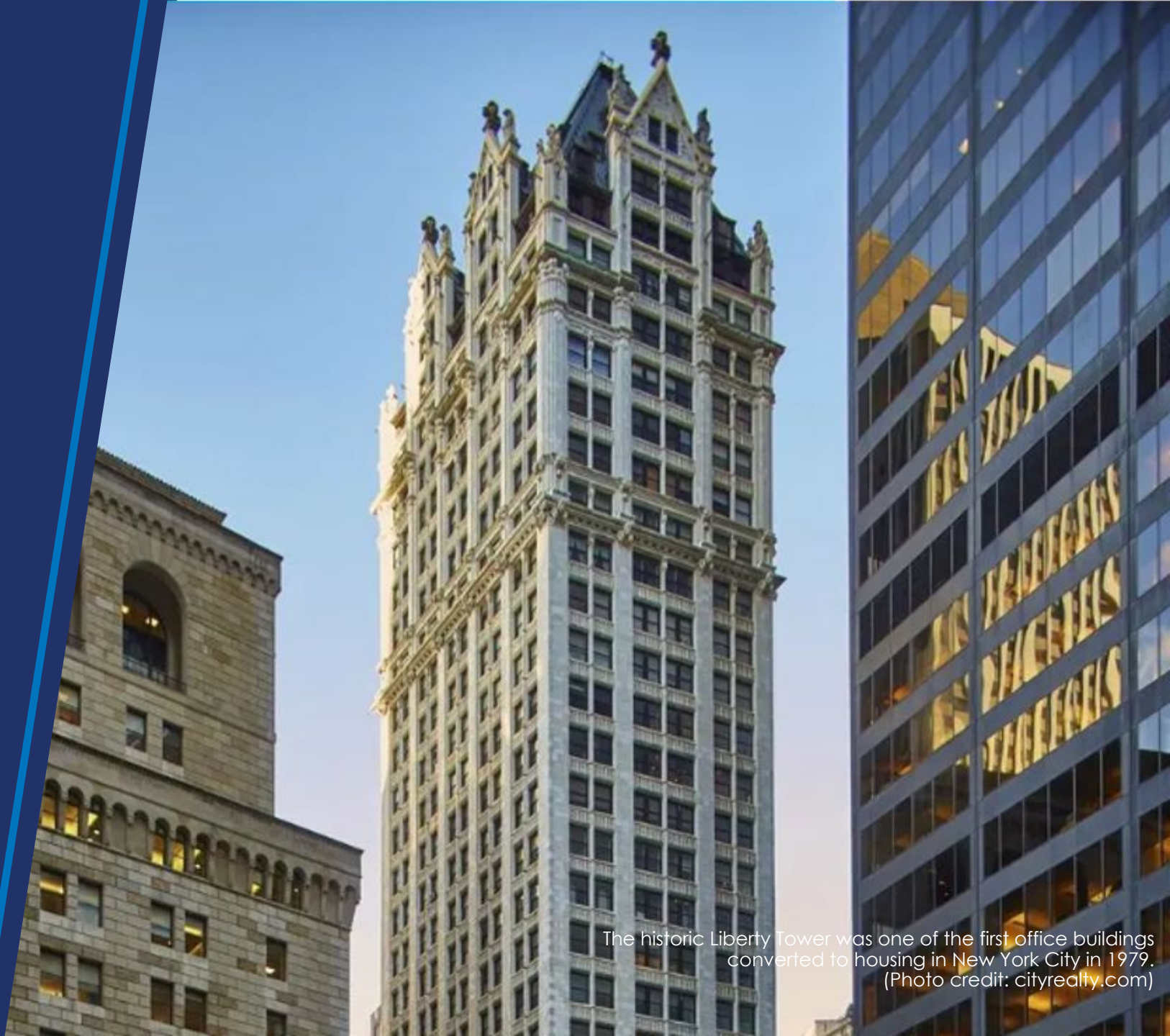
The historic Liberty Tower was one of the first office buildings converted to housing in New York City in 1979.

*Examples for illustration only; reference the Program Comment.